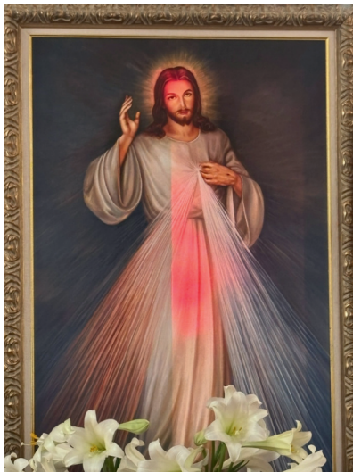
Our Divine Mercy image in church - notice the red shining through from a stained-glass window during Divine Mercy week in 2025.