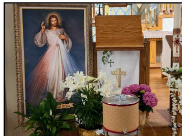
Our Divine Mercy image in church.

“Whenever I go to the chapel, I put myself in the presence of our good Lord, and I say to Him, ‘Lord, I am here. Tell me what you would have me to do’ . . . And then, I tell God everything that is in my heart. I tell him about my pains and my joys, and then I listen. If you listen, God will also speak to you, for with the good Lord, you have to both speak and listen. God always speaks to you when you approach him plainly and simply.”