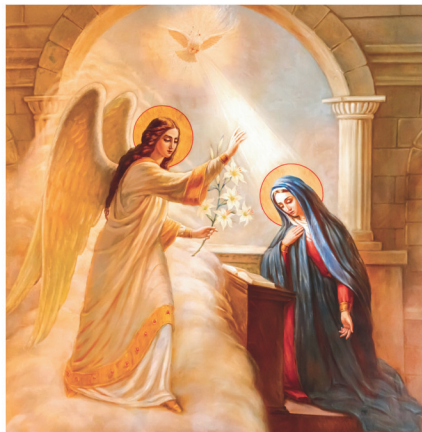
One "yes" can change the world The Annunciation of the Lord

Good and gracious God, I know that life can be unpredictable. Sometimes I know what is good and right, but I don't have the courage to do it. Sometimes I am so busy with my own affairs, I forget to see the needs of people in front of me. Sometimes I am set in my own ways, and I resist growing and learning. Help me, Lord, to be open to Your will. When You prompt me to do the right thing, give me the courage to do it. When those around me need my help, give me Your heart to love them. When I'm stuck in my own ways, give me the grace to grow closer to You every day. Give me the trust and confidence of Mary. Let it be done unto me according to Your word! Amen.